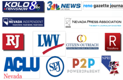
Right to Know Coalition